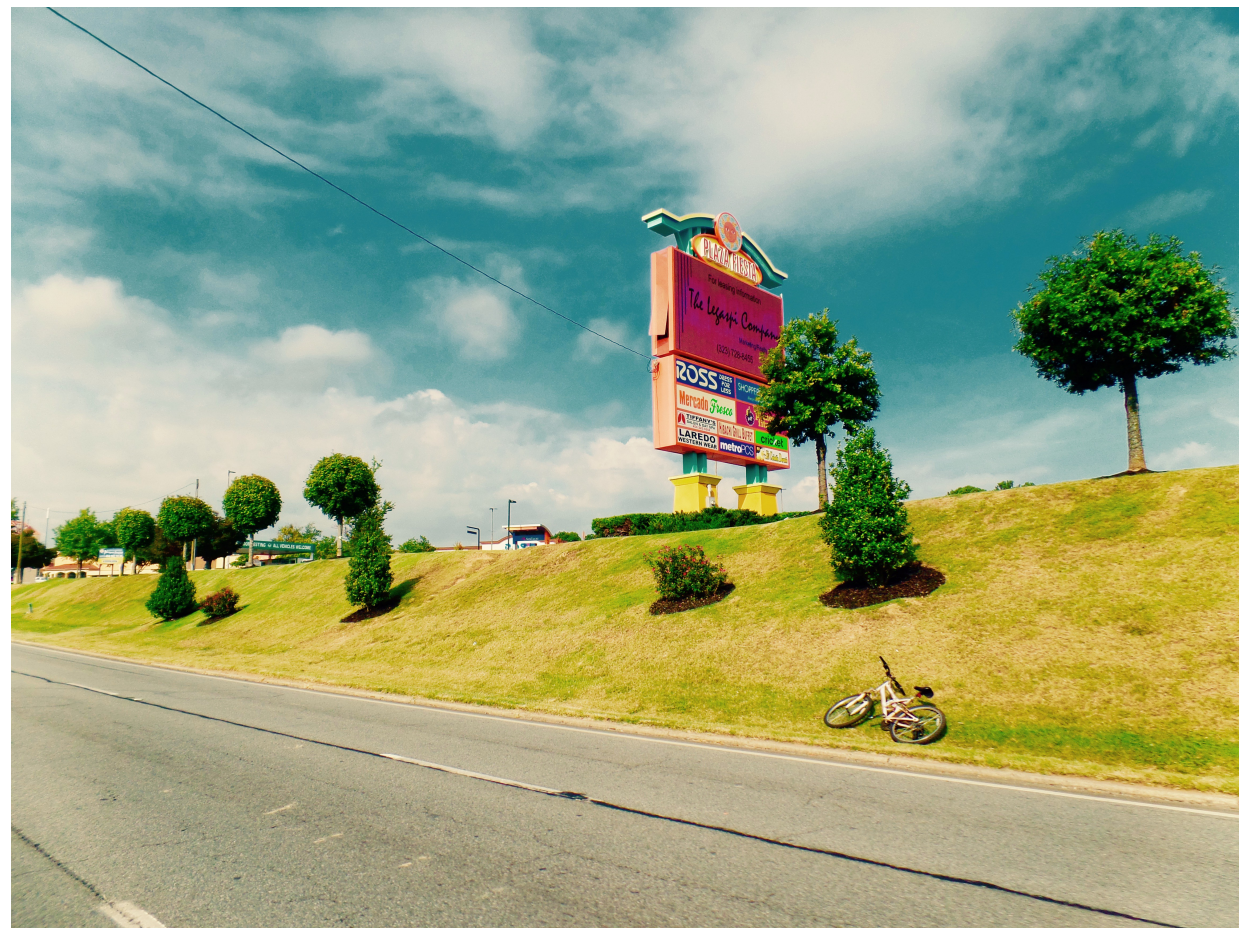
Figure 4. Plaza Fiesta, Buford Highway, Atlanta

The daily reality of a changing South in these areas is evident, as metropolitan Atlanta is quickly reborn as an immigrant destination. This South attracts immigrants—and local cities have in many ways relied on immigrant residential growth and immigrant entrepreneurship to revitalize suburbs that previous residents had already abandoned for other, better suburbs. Latino and Asian immigrants found homes and opened businesses there. When a major grocery retailer left Jimmy Carter Boulevard, Vietnamese immigrant entrepreneur Ben Vo built Hong Kong Supermarket, in turn stimulating the growth of other mom-and-pop restaurants in the plaza. In both Norcross and in Doraville, pictured below, the reoccupation of retail space is driven by Mexican, Central American, Vietnamese and Korean entrepreneurs.