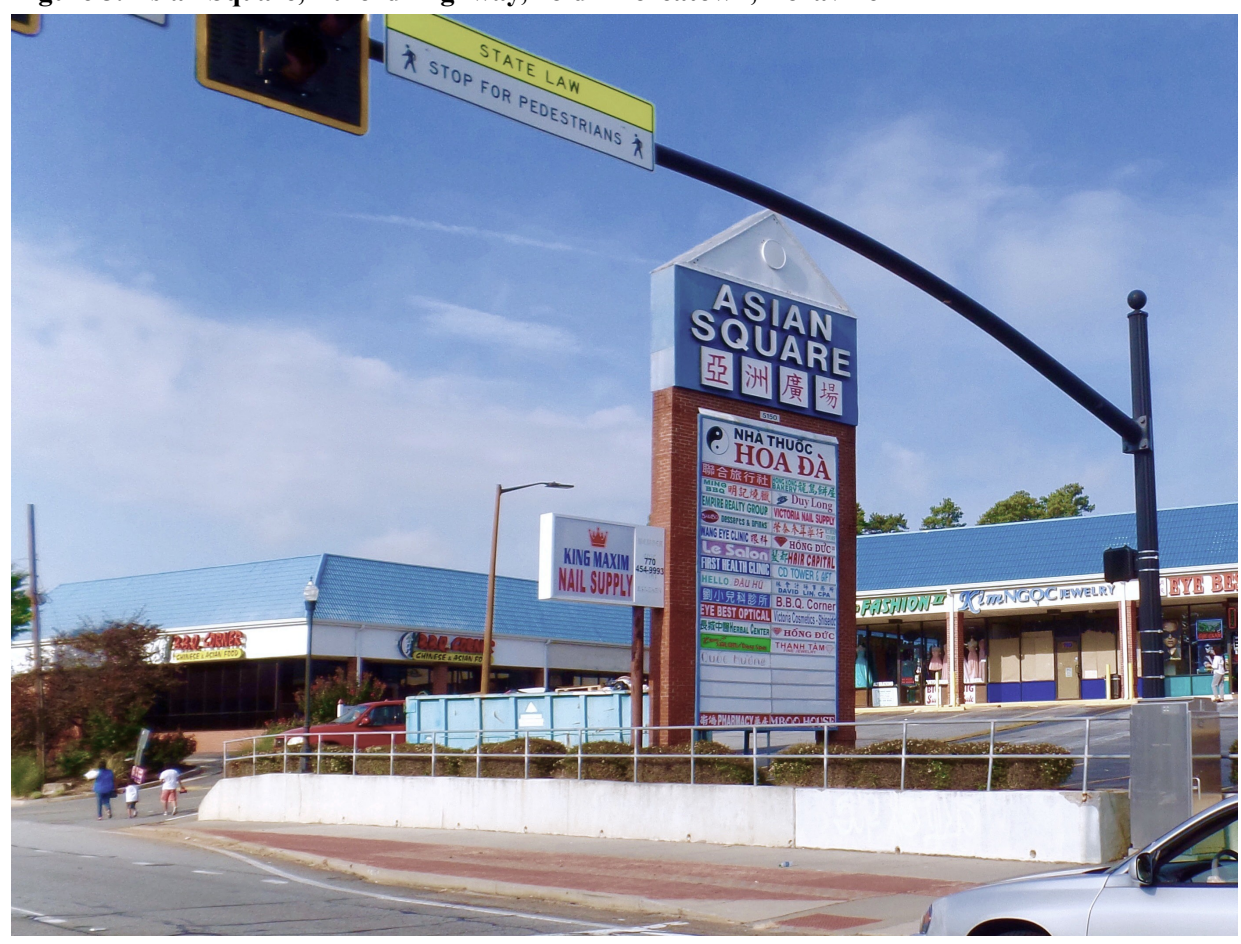
Figure 3. Asian Square, Buford Highway, "old" Koreatown, Doraville

Gwinnett County's rapid growth has been largely due to new immigrant preferences for the northeasternmost counties of the MSA. It also reflects the ongoing intra-suburban mobility of immigrant populations. For instance, while the city of Atlanta has no Koreatown, an "old" Koreatown can be found right on the inner-ring perimeter of the city, approximately 14 miles from downtown Atlanta.